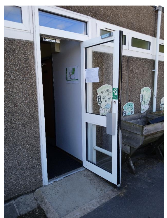
These are the toilets you will use.