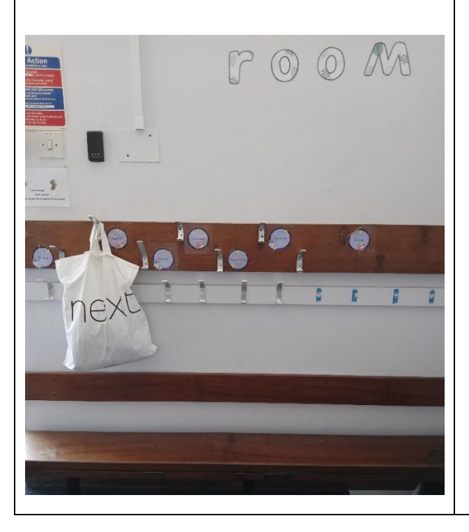
This is where you will put your bags and coats.